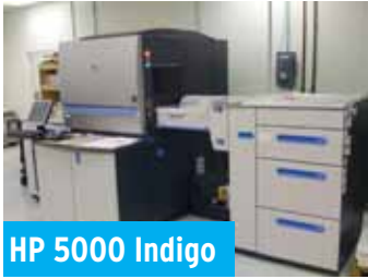
HP 5000 Indigo

sheet. With the Delta Water System, hickeys are cleaned off the plate before they show up on the sheet.