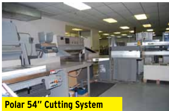
Polar 54" Cutting System