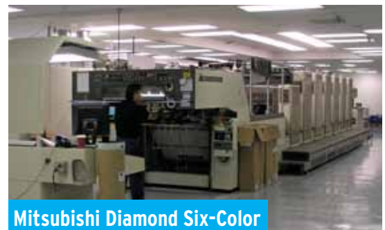
Mitsubishi Diamond Six-Color

"Based on industry standards, Garrity Print Solutions has the resources to produce $10 million to $12 million per year in business."