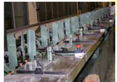
Muller Martini Perfect Binder

We have two heavy-duty Harris saddlestitchers, capable of stitching up to 13" x 19" forms. One is a six-pocket-plus-cover feeder and the other is a three-pocket-plus-cover feeder. This allows us to stitch two different jobs at once. Along with the saddlestitchers, we have a 16-pocket Muller-Martini Panda perfect binder and a three-knife trimmer. The perfect binder can bind up to a 12" x 15" sheet. GPS has two 22" x 32" Heidelberg die cutters, and two Moll Versa folders for gluing pocket folders and numerous other specialty folds.