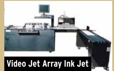
Video Jet Array Ink Jet

If we need to ink jet address any mailer, we have two ink jets. Both ink jets are made by Video Jet. One ink jet is alcohol based, while the second has a Wide Array HP ink jet head that gives the name and address a high-quality lasered look. This ink jet has a continuous feeder for faster run speeds, a powerful DH3200 dryer, and, if needed, an inline tabber. This ink jet is three years old. GPS has an additional Pitney Bowes inserter with a camera to match multi-page forms such as monthly statements. It also has six pockets for additional generic pieces to be inserted. This inserter was purchased in December 2003.