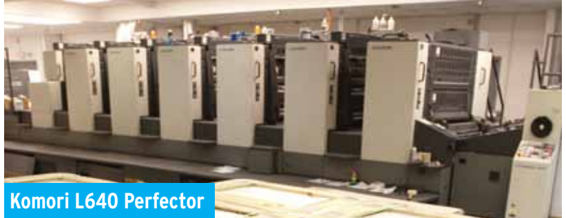
Komori L640 Perfector

In October 2008, our pressroom upgrade was completed with the purchase of another high speed 28" x 40" Komori L640 Perfector. This press can print straight six colors, or in minutes change to a perfecting press that will print two colors over four colors. It also has a scanning densitometer for complete color control, allowing the press computer to manage the color. This press will save the customer money by printing two colors over four colors in a single pass.