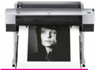
Epson Stylus Pro 9880

Our Prepress Department offers state-of-the-art prepress capabilities by maintaining the latest version of design and prepress software. In July 2006, we installed the Kodak Prinergy EL workflow system with the ability to preflight, trap, and color manage. The Prinergy workflow system maintains full integration with the production workflow by checking and correcting input files automatically during processing of customer input files; providing automated PDF-to-PDF trapping; converting RGB to CMYK and handling spot colors; mapping spot colors to process colors based on standard or customized ICC profiles; and easily