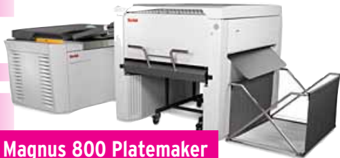
Magnus 800 Platemaker

processing transparent files without flattening by using the new Adobe PDF Print Engine. Prinergy integrated with Preps Imposition Software allows for mistake-free imposition. This software package also includes Kodak's Insite software, which allows GPS to accept PDFs, automatically flight-check the PDFs for mistakes, and immediately return them to the customer for corrections if necessary. If there are no corrections, Insite will impose the files and produce a blueline.