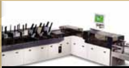
Pitney Bowes Inserter/Cameras

Our Mail Shop is second to none. GPS uses Postal Soft, U.S. Post Office approved software, to CASS certify (Coding Accuracy Support System) / PAVE certify (Presort Accuracy Validation and Evaluation) mail list.