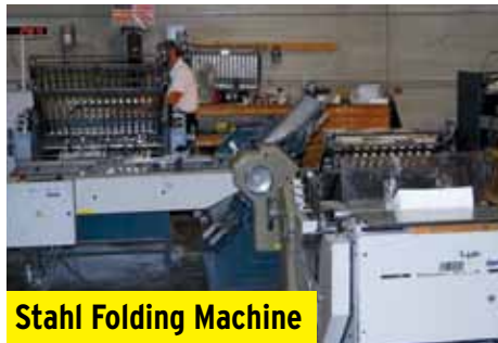
Stahl Folding Machine

Our bindery is Heidelberg based with a Polar 54" cutter that has 198 programmable memory channels, a 130-B Transomat B stack lifter, a RA-4 automatic jogger and scale, and a 130-4 Transomat E unloader. This system is computer driven for program-precise cutting and employee-friendly workflow. We have two high-speed Heidelberg Stahl continuous feed 32-page folders and a Baum 20" folder with fugitive glue. Rather than vinyl 'tab' our customer mailers, which are difficult for the recipient to open, the fugitive glue makes for easy opening and still meets postal regulations.